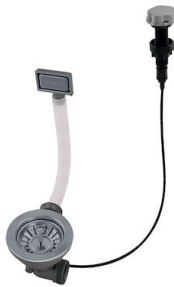
Gun Metal automatic waste fitting - PG