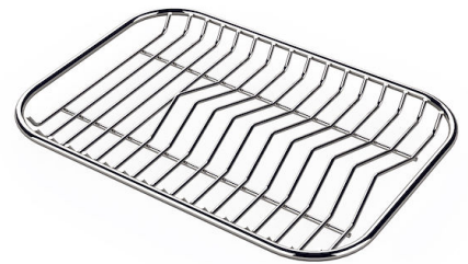
Stainless steel plate rack only usable in combination with the accessories 8644 003 8100 154