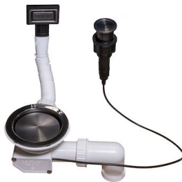
Space Push Gun Metal automatic waste fitting - PO